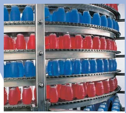
Up to 400 FPM