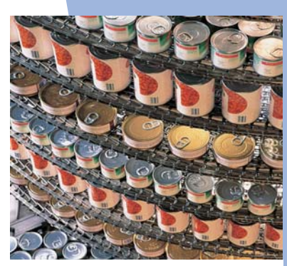
Reduces Label Damage