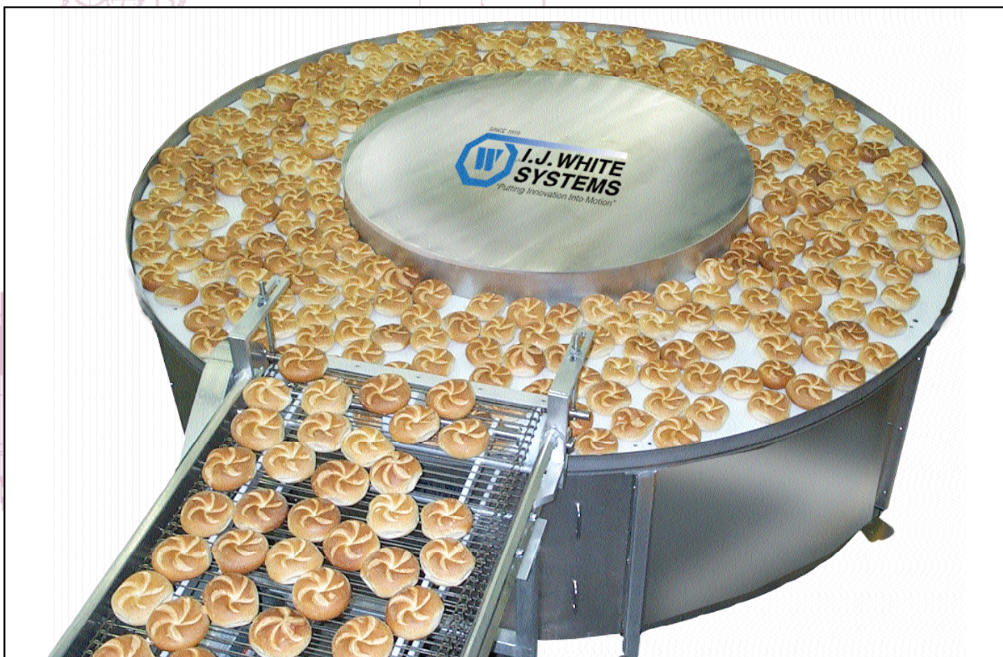
Rolls courtesy of Lakewood Bakery